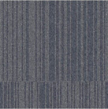
Product: Create Multiple colourways available