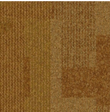
Product: Width Multiple colourways available