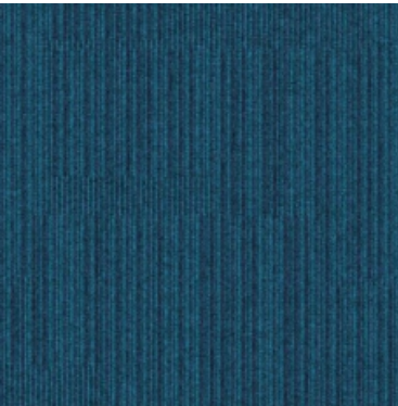
Product: Poise Multiple colourways available